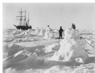
Who lives in Antarctica?