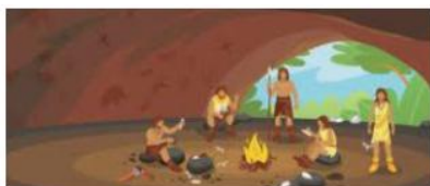
From Rock to Heavy Metal

The exciting topics I will be learning about in Year 3 are: