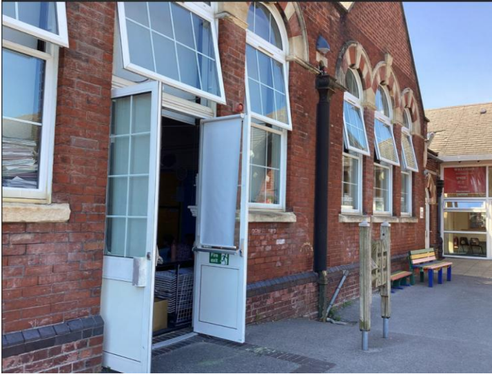
Miss Spake (KS1 Entrance)