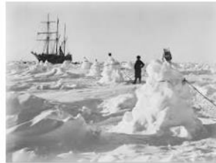
Who lives in Antarctica?