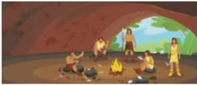
From Rock to Heavy Metal

The exciting topics I will be learning about in Year 3 are: